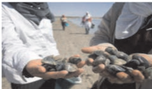
FAO project helps Tunisian women earn a living harvesting clams.

international plans of action dealing with seabirds, sharks, fishing capacity and illegal, unreported and unregulated (IUU) fishing to support the code. Two special strategies have been designed to improve data collection and monitoring systems for both capture fisheries and aquaculture. A series of technical guidelines, intended to help translate the code's principles into action, further promote the code's implementation.